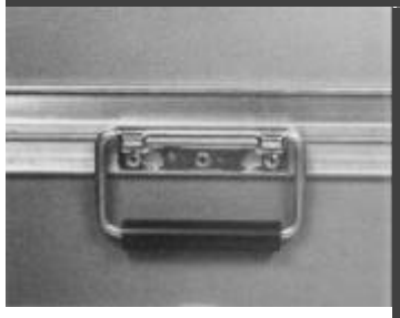
Self retracting handles with rubber grips

UNITED SUPPLIES KEYED LATCHES UNLESS OTHER-WISE SPECIFIED. HEAVY DUTY CASES CAN BE MODIFIED TO MEET THE REQUIREMENTS OF MIL-C-4150 AND MIL-STD-810.