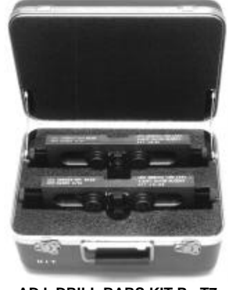
ADJ. DRILL BARS KIT Pg T7