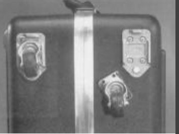
Heavy duty removable casters