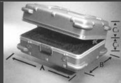
Capable of providing cases 24" deep for each lid for 48" total depth with overall dimensions of 54" x 82."