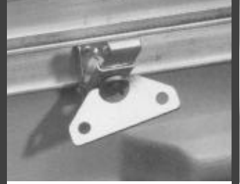
Quarter-turn latch with pressurized clamping