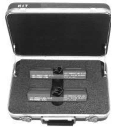
DRILL BARS KIT Pg T12