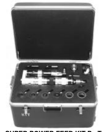
SUPER POWER FEED KIT Pg T5