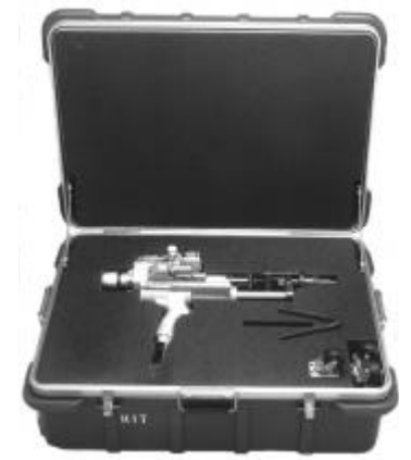
SPACEMATIC KIT Pg T6