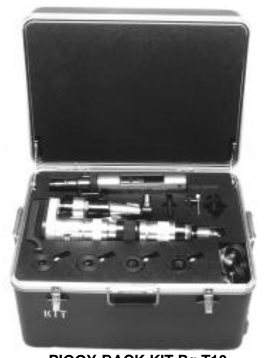
PIGGY-BACK KIT Pg T13