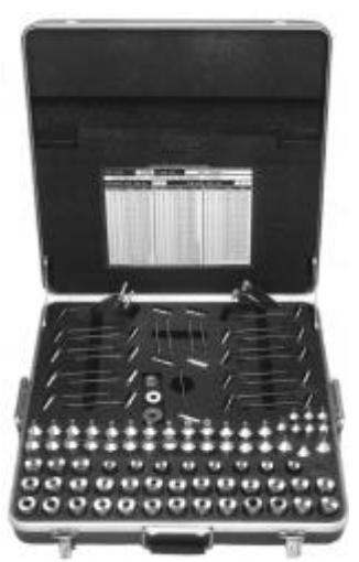
ALIGNMENT BUSHING KIT Pg T15