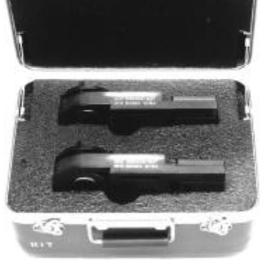
UNIVERSAL SWIVEL KIT Pg T9