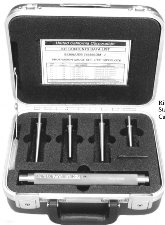
Rib-I Stacker Case

The Kit shown was manufactured and ground to metric standards for Deutsch Air Bus, Hamburg, GM. Now available.