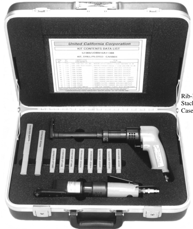
Rib-I Stacker Case

This Carbide Cutting Tool Kit contains straight and offset high speed Pneumatic Air Drill Motors, eight encased Piloted Carbide Drills and two encased Carbide Reamers. Shockproof Rib-I Stack Case UDB-916A11388-13 is 18" H x 13" W x 5" H with foam inserts.