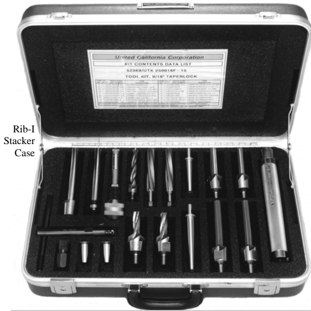
Rib-I Stack Case

UNITED designed this Emergency Kit for spare repair for the F15. Concept by Al Mischaud, McClellan AFB. Technical Direction by UNITED Experts . Call or Fax UNITED for details.